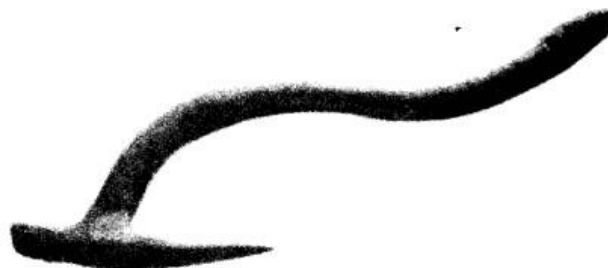
A Toy Plough