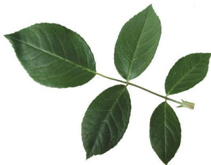
(a) A Leaf